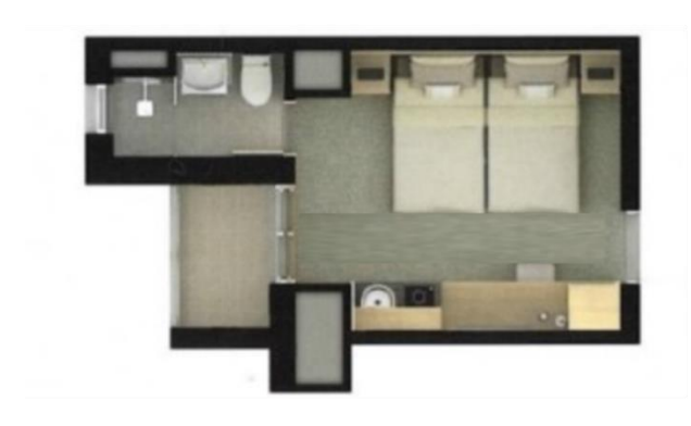
Double Room with two Beds