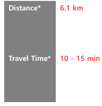
*Distances and approximate travel times by car using the most direct route.