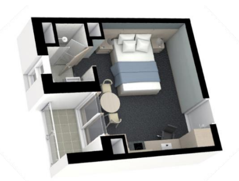
Single Room with one Bed