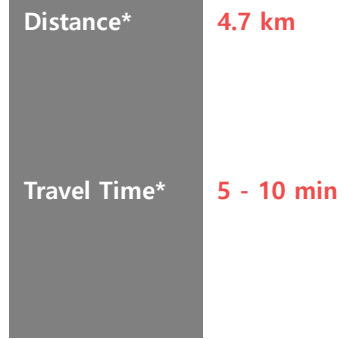
*Distances and approximate travel times by car using the most direct route.