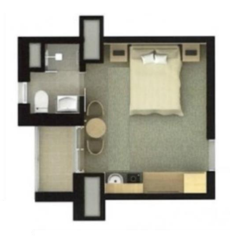
Single Room with one Bed